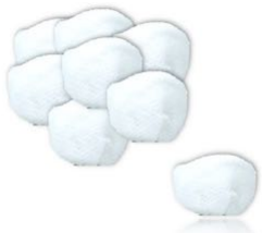
N Medical United 0000 Non Woven Balls