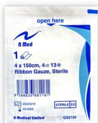
N Medical United 0000 Ribbon Gauze CS210