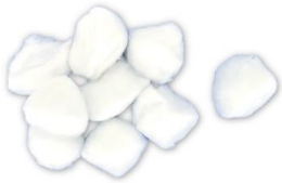
N Medical United 0000 Cotton Balls