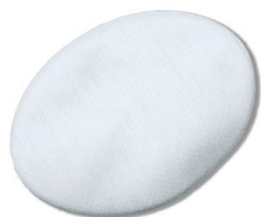
N Medical United 0000 Non Woven Eye Pad EN000