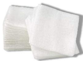
N Medical United 0000 Gauze and Swabs